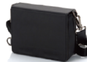
[ Carry-on bag ]