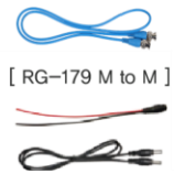
[ RG-179 M to M ]