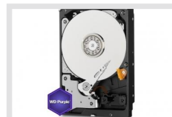
HDD-4000SATA Purple|SKU: 217659