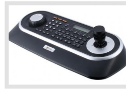
KBD-2USB | SKU: 217652