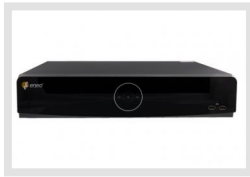
IEM-38R640005A | SKU: 217651