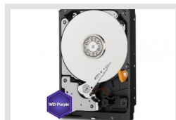
HDD-2000SATA Purple|SKU: 217658