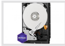
HDD-8000SATA Purple | SKU: 218583