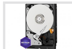
HDD-6000SATA Purple|SKU: 217660