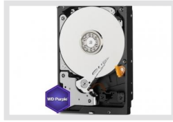
HDD-4000SATA Purple|SKU: 217659