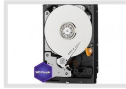
HDD-6000SATA Purple|SKU: 217660