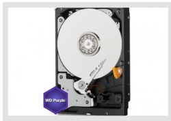
HDD-2000SATA Purple|SKU: 217658