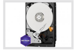
HDD-8000SATA Purple|SKU: 218583