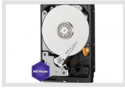
HDD-3000SATA Purple|SKU: 217657