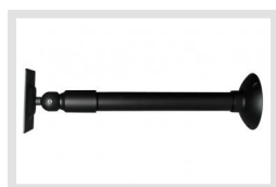
VMC-LCD/WCMB-1 | SKU: 90394