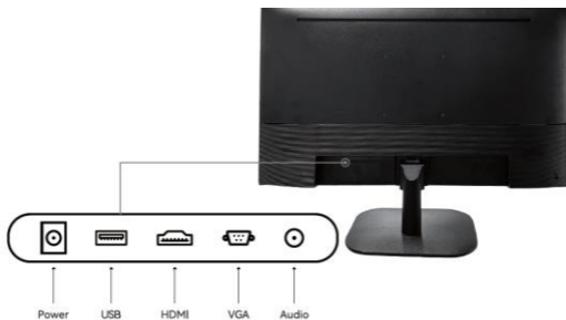
Figure 1-1 Overview of the connections

The overview of the connections is shown below.