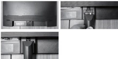
Figure 2.2 Install display